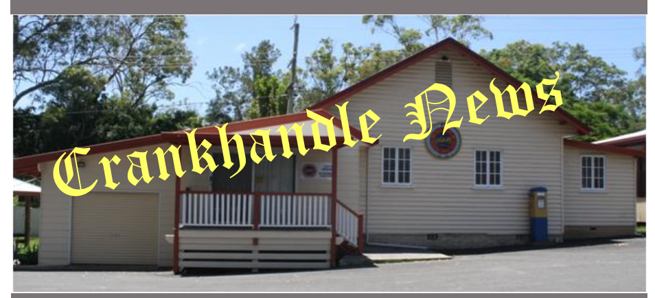
The Official magazine of the GOLD COAST ANTIQUE & CLASSIC AUTO CLUB